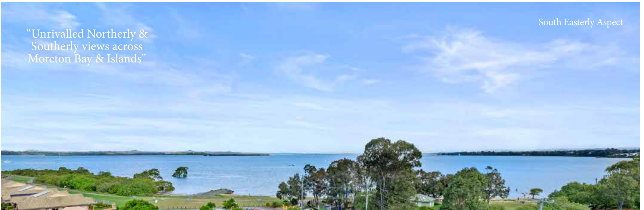
South Easterly Aspect

“Unrivalled Northerly & Southerly views across Moreton Bay & Islands”